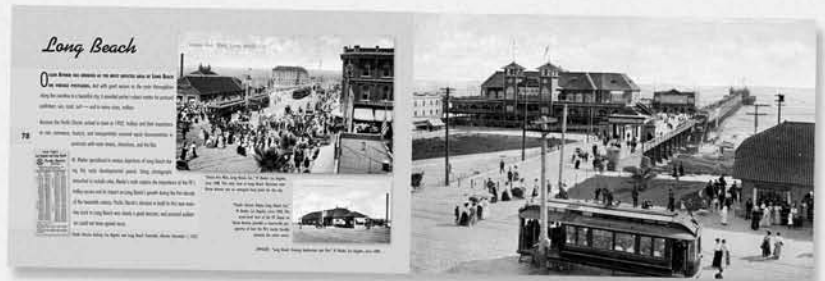
Full-color reproductions of vintage postcards show how Southern California presented itself to the rest of the country (and world) at the turn of the century through the 1950s: as an exciting, visually beautiful place to live and do business.

For more information and to see the book in full color, visit LARH.org